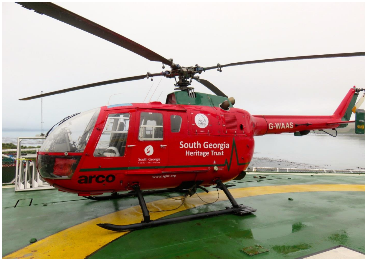
Helicopter Alpha Sierra on the helideck of the RRS Ernest Shackleton displaying the Darwin logo just beneath the rotor blades