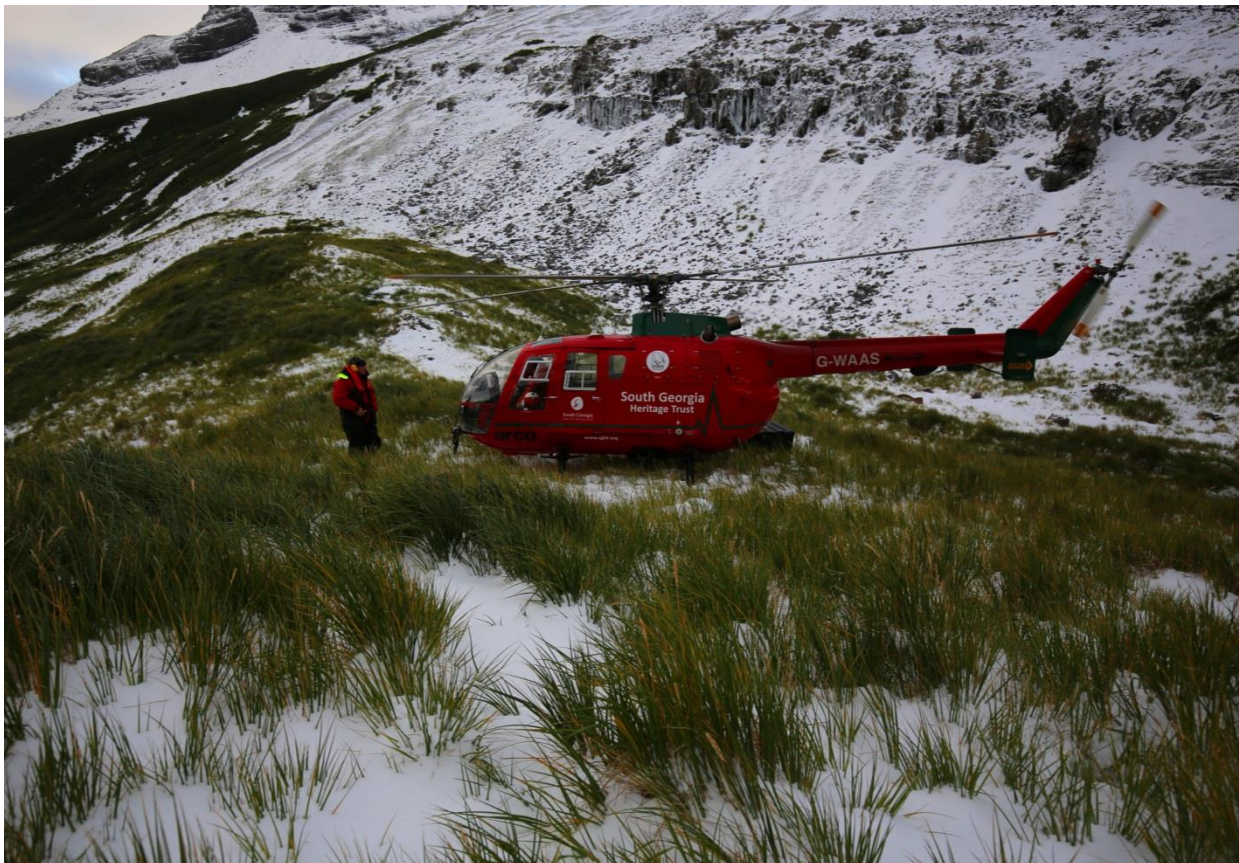
Helicopter on the ground at Cape Rosa, one of the (former) mouse-infested areas, to commence monitoring work.