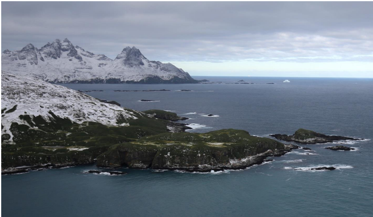
The project areas of Cape Rosa and Nunez Peninsula (behind) viewed from the air.