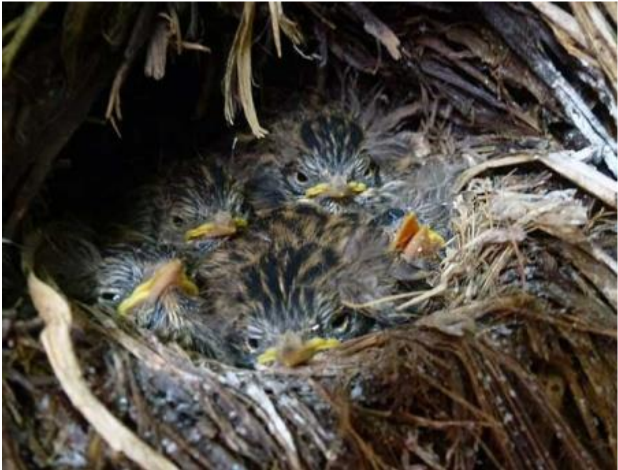
The first South Georgia Pipit nest to be discovered in an area treated for rodents as part of the wider Habitat Restoration Project. The nest, with five healthy chicks, was found on an area of land very close to the mouse zones which was baited for rats in 2013.