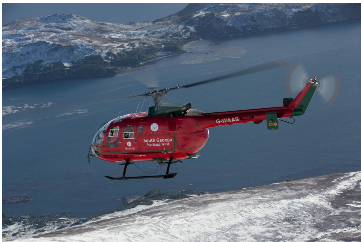
Alpha Sierra in flight over South Georgia displaying Darwin logo.