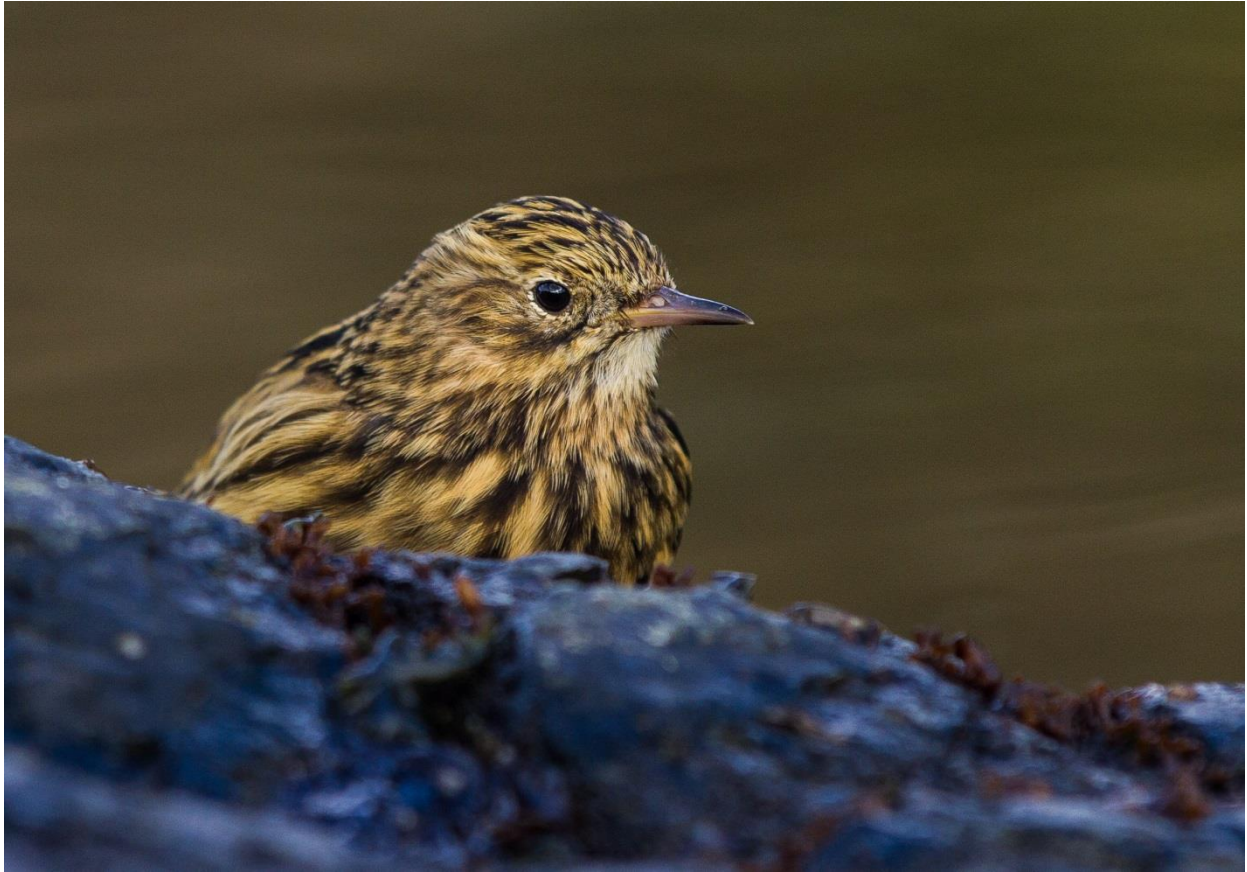
South Georgia Pipits were seen in increased numbers this season across the areas of the island previously treated for rodents.