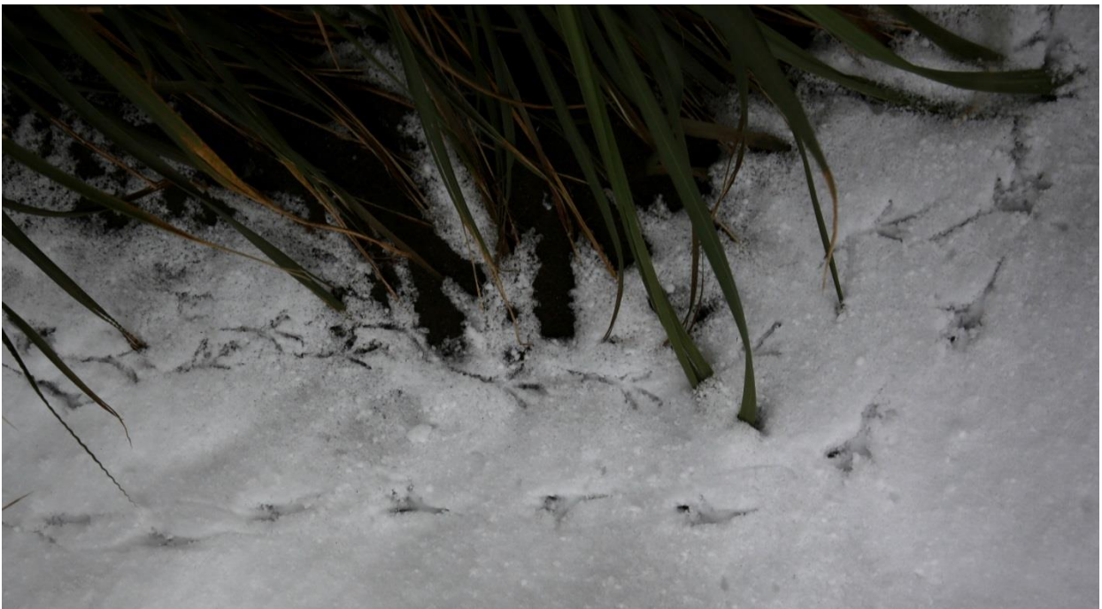
South Georgia Pipit footprints in the snow in the former mouse zones – an encouraging sign.